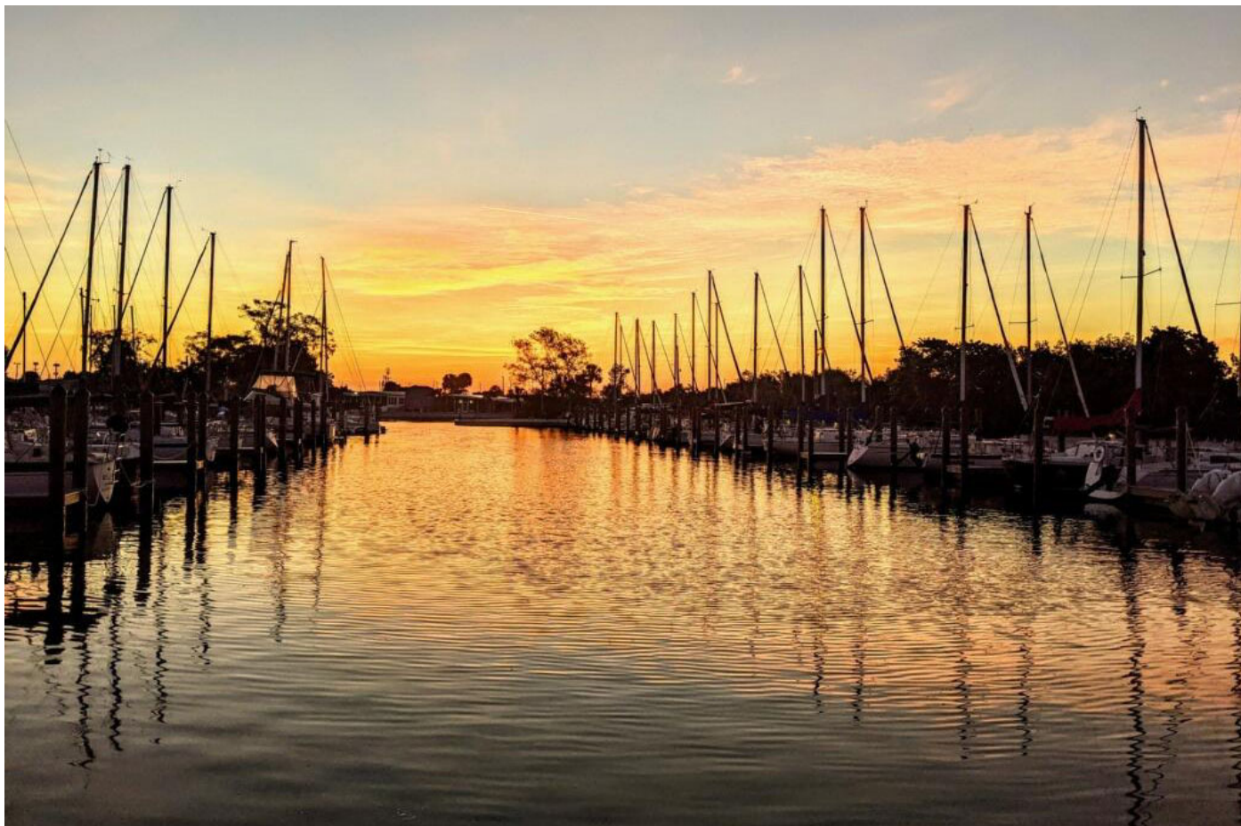
Above: Sunrise at Bayshore Gardens Marina.