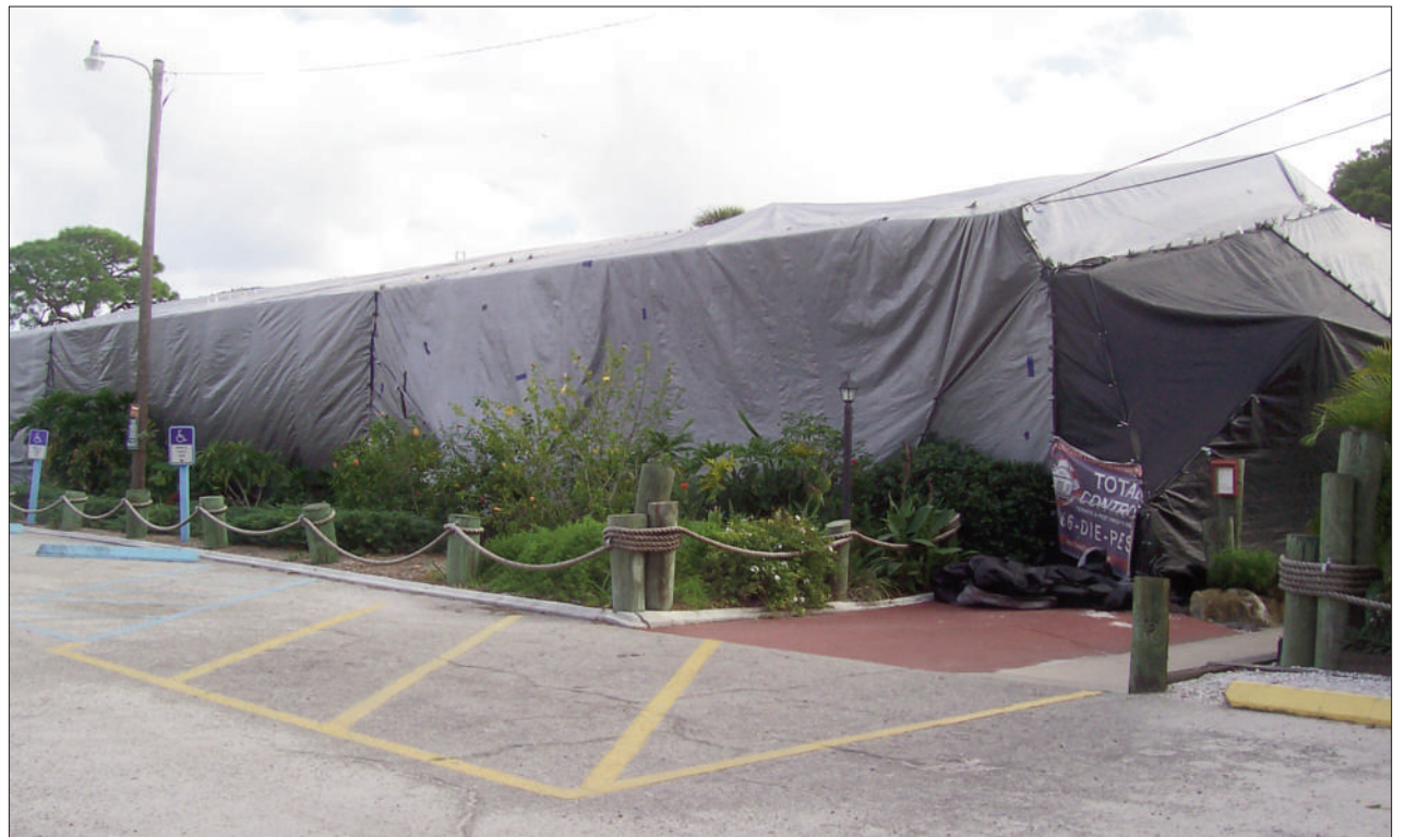
During the first week of December, the Bayshore Gardens Recreation Center was tented for termites. Here are some pictures taken during that time, in case you missed seeing it.