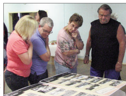
Bayshore residents study the historic designation study at last April's Neighborhood Association meeting.