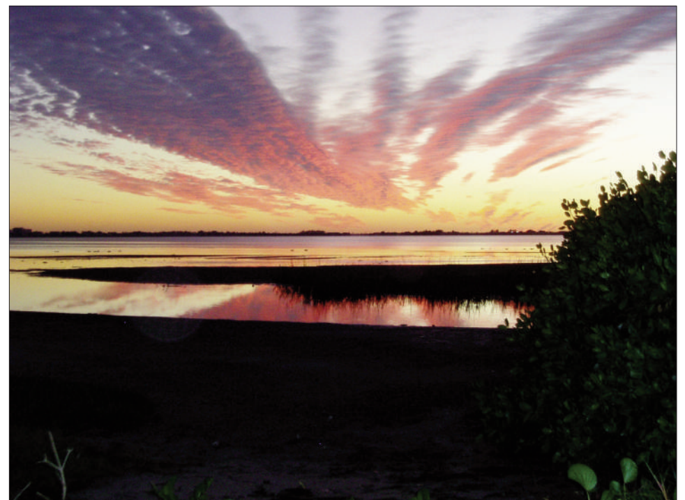
A wonderful sunset photo taken right off Bayshore at the sandbar at the end of 34th Street W. The sky was so amazing that night, that our area made the news from all the photos going viral!