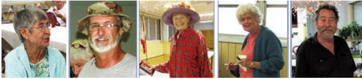
These volunteers have been caught candidly, while they were at work at the Rec Center!