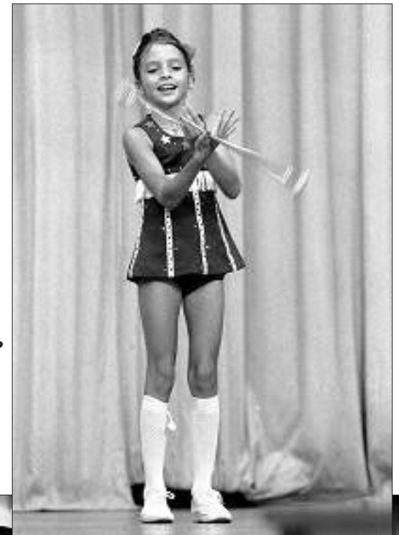
Who is the 'twirler' ?

Here are two photos from a talent show held in the spring time in the 1970s: