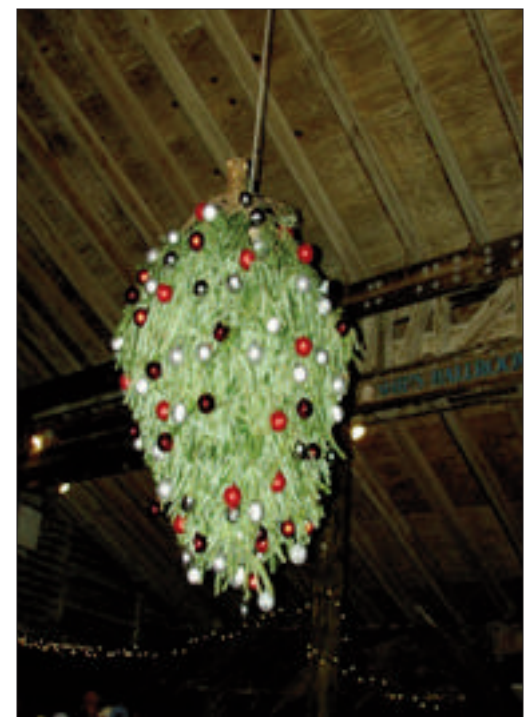
The non-traditional Christmas tree adorned the outdoor pavilion.