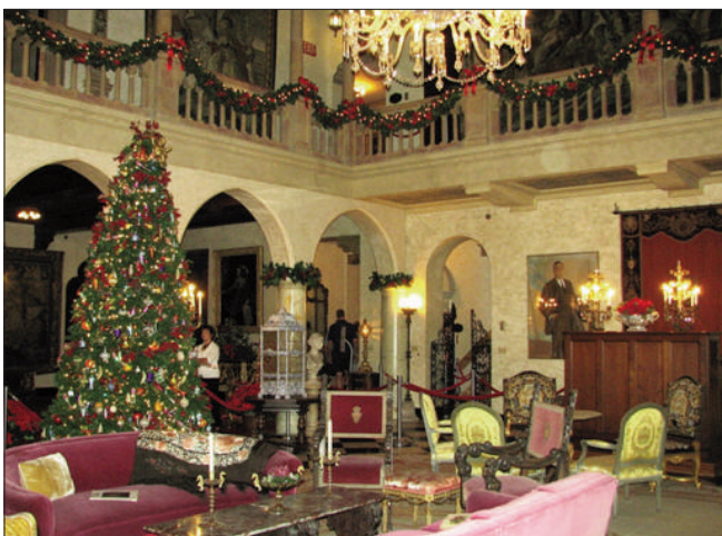
As usual, the Ringling home of John and Mable was decked out to the nines!

On December 5, members joined in support of the annual TOYS FOR TOTS event at the Ringling complex. The house tour and the music was fantastic!