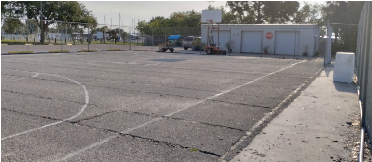
Basketball Court - Close up