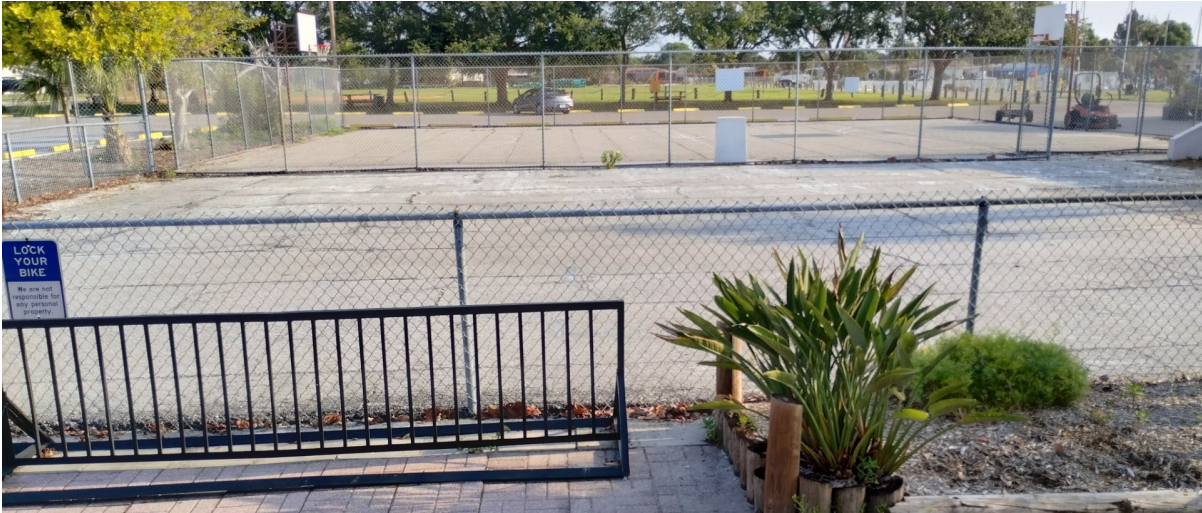
Before Project was started