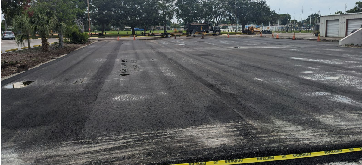
Asphalt done. Asphalt will take about 45 days to cure